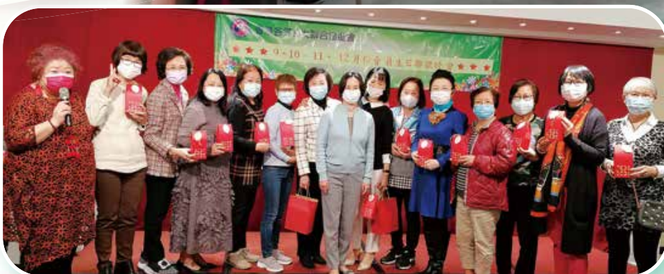
9-12月份會員生日會於12月3日假金鐘名都酒樓舉行，延開6席，反應踴躍。Birthday party for Sept-Dec birthday members was held on 3rd December at Admiralty Metropolis Restaurant. Six dinner tables were arranged, everyone had a blast.