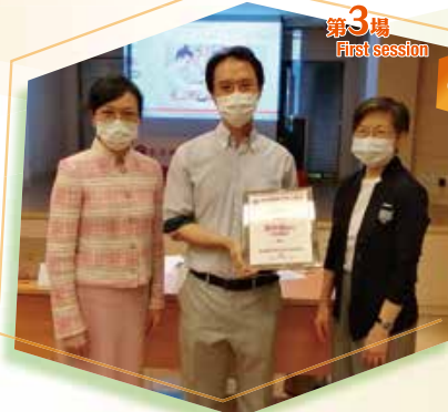
第3場 First session

特別鳴謝內分泌及糖尿科專科陳諾醫生贊助免費驗肝十個名額供抽獎。講座影片已上載至HKFW YouTube頻道及婦協網頁供會員及公眾人士觀看。