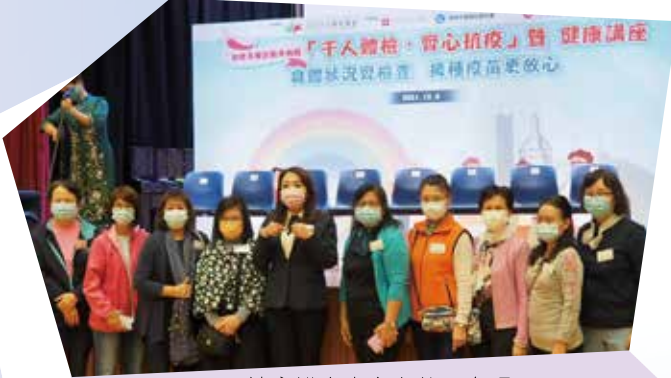
健康講座嘉賓與義工合照 Guests and volunteers in the health talk

為響應政府「全城起動，快打疫苗」運動，海怡半島婦女聯合會有幸得到有心人贊助，於去年11-12月聯同專業醫療機構合辦了「身體狀況齊檢查，注射疫苗更放心」活動，免費為100名海怡居民提供抽血、身體檢查、接種疫苗、健康講座等醫療服務，有助共建共融健康社區，亦為推動政府抗疫政策發揮正能量！