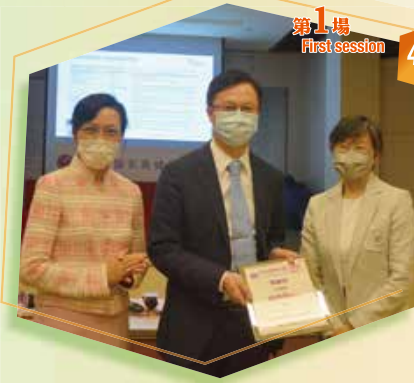
第1場 First session